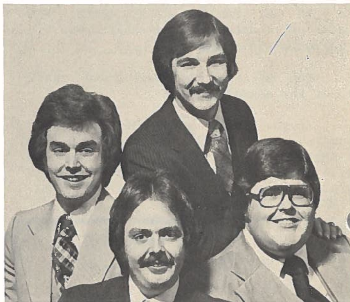
THE FOX BROTHERS