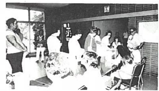
Southwest consumers voting for their Trustees and registering for the door prizes.