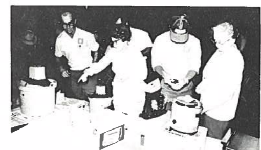
A trip to the prize table is a real treat for the members whose names are drawn.